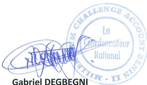
Gabriel DEGBEGNI National Coordinator

Procurement N°: PP2-COM-ADM-05.3 Procurement Method: Shopping Activity Name : Acquisition of office supplies and accessories (Lot 3: Computer consumables) Signature of contract: February 27, 2019 Awarded to: SERGE ET SILVERE Price: 9 517 500 FCFA Duration: 06 months Scope (Summary): The supplier has to deliver computer consumables (Lot 3).